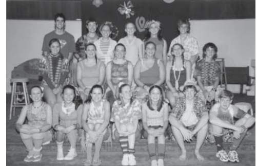
The Troupe of Acts

The Troupe of Acts St. John's Lutheran Church, Exton, PA