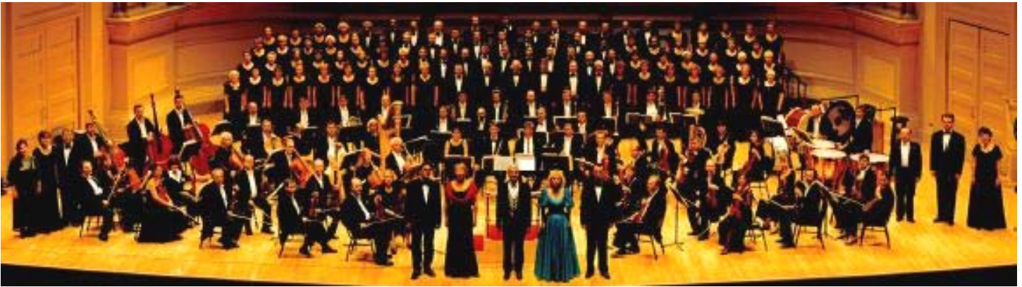
Kyiv Symphony Orchestra and Chorus at Carnegie Hall