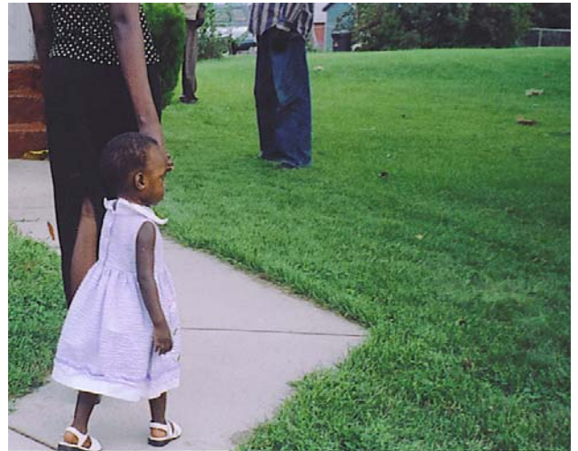
Walking in Suburbia