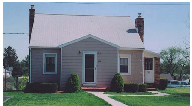
House in Oberlin