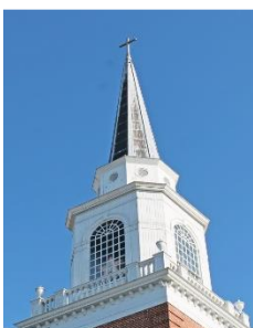
Steeple rehab needed