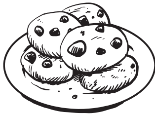
Plate of Cookies