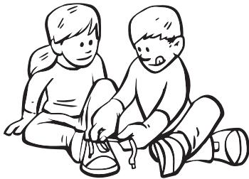
Brother & Sister