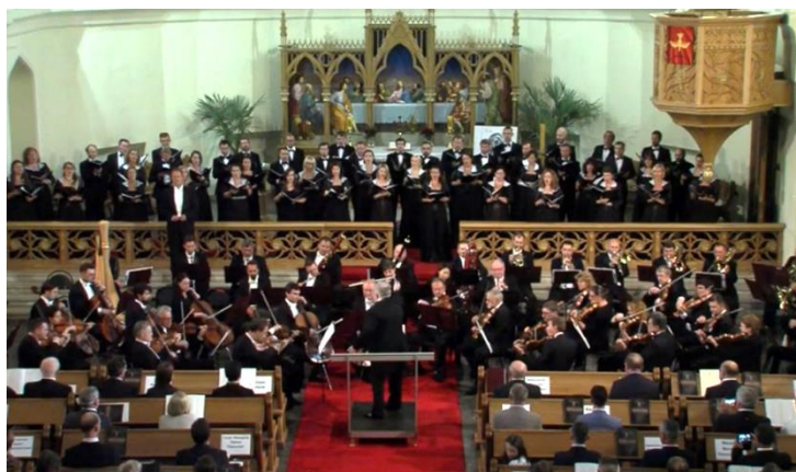
Performance at St Peter And Paul cathedral.