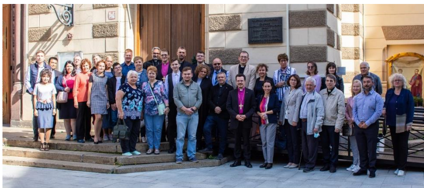
Members of ELCR participating at the event.

The Evangelical Lutheran Church of Russia, a church that founded by German speaking migrants to Russia and a church that suffered greatly during the War and the Cold War due to its German heritage, commemorated the end of WWII in Moscow on Sept 2, 2020 at the Lutheran Cathedral of Saints Peter and Paul.